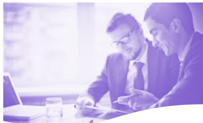
European Economic Forum