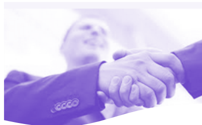
Regional Office of Lodzkie in Brussels