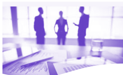
International Congress of Bioeconomy