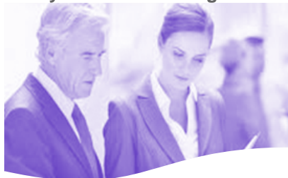
Representative Office of the Lodzkie Region and the City of Lodz in Chengdu