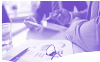
Lodz Knowledge Transfer Platform